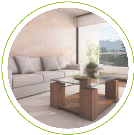
Interior and exterior decorative sheathing for walls and ceilings.